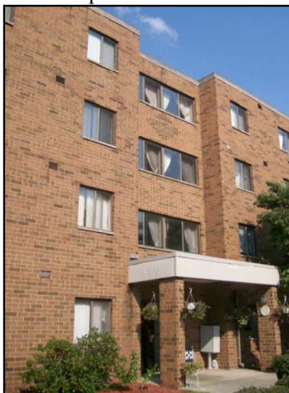
Highland Place Apartments Prior to Rehabilitation