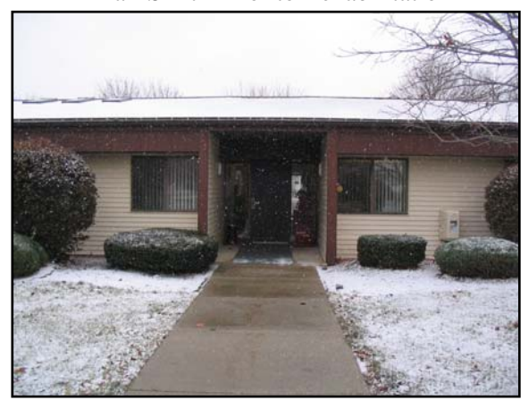
Hinman-Smith Prior to Rehabilitation