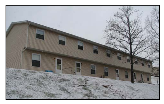
Powell Apartments after Rehabilitation